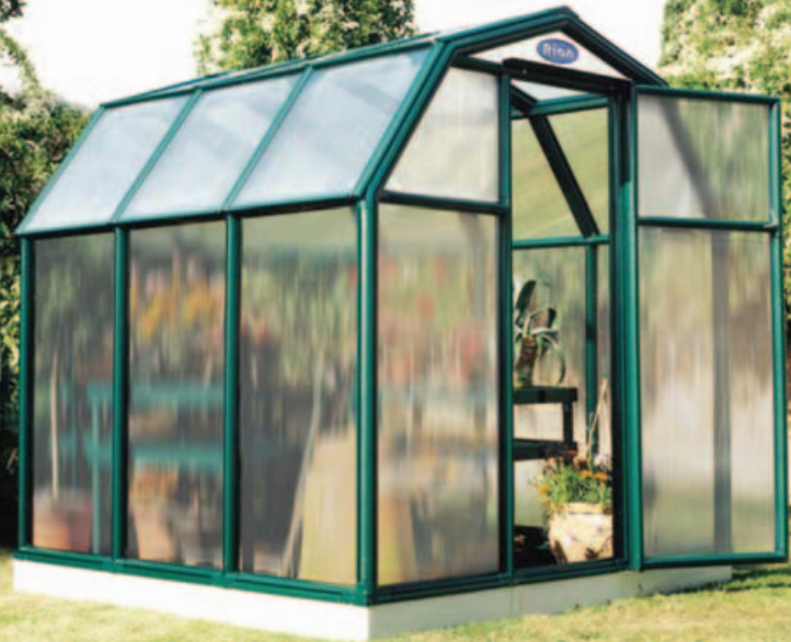
Only available in green frame

Our ECO line is a DIY compact & roomy, attractive barn-shape Greenhouse giving you more headroom & growing space