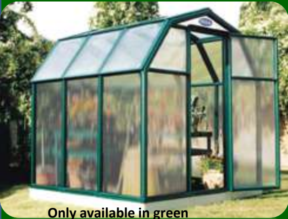
Only available in green

Our ECO line is a DIY compact & roomy, attractive barn-shape Greenhouse giving you more headroom & growing space