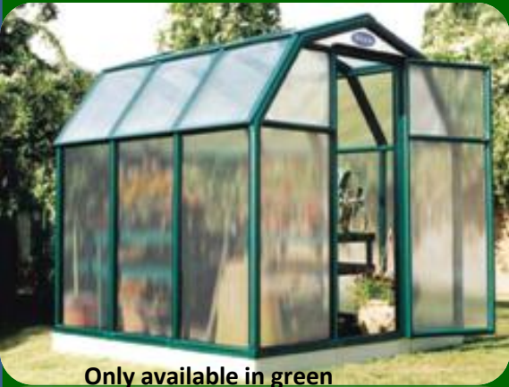
Only available in green

Our ECO line is a DIY compact & roomy, attractive barn-shape Greenhouse giving you more headroom & growing space